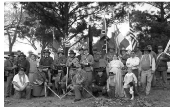
Louisiana Division Sons of Confederate Veterans at the Natchitoches Christmas Parade 12/4/2010